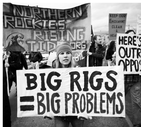
Rising Tide activists and locals from Missoula, Montana protesting the shipment of machinery to Alberta

If you are flying, come into the Spokane, WA, Lewiston, ID, Moscow/Pullman, ID or Missoula, MT. If you are coming from the Idaho side you will head east on US 12. From Missoula you will head west on US 12. Keep an eye on the web sites or contact us. The site will be between Kamiah, ID and Lolo, MT.