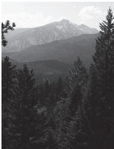
The Bitterroot Mountains

The Northern Rockies-the Wild Rockies- hosts so much large fauna, it's hard to wrap your mind around all the diversity from moose, black bear, mule deer, white-tailed deer, elk, bighorn sheep, mountain goat, wolves, and mountain lions and so many more. Yes, mountain lions slinking under the sheer walls of Trapper Peak at a mere 10,157 feet.