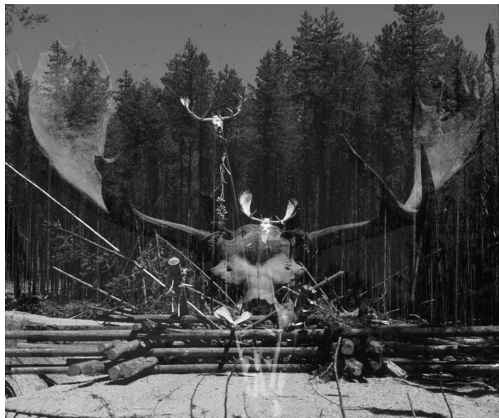
Photo overlay of the Jack Squat

They logged the Jack sale, but never logged the rest of Cove Mallard. Warner Creek was also saved. Yes, we do win sometimes.