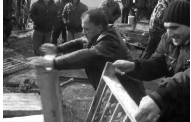
Protesters destroy drilling samples at a would-be iron mine near Hrazdan

a banner reading "Not with Our Money" from atop two 50-foot flagpoles at the Bank of America's headquarters in downtown Charlotte, North Carolina. Six more arrested below—two while supporting the climbers, and four while blocking the main entrance to the bank's headquarters.