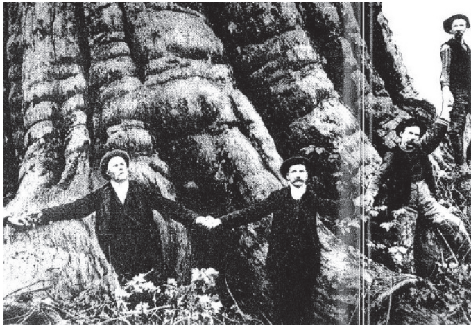
God's Valley Spruce, 1903